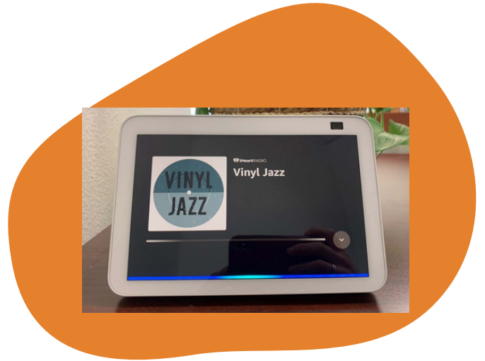
Blue light bar on Echo Show

You will always be able to tell when Alexa is listening to your request because a blue light indicator will appear on your device.